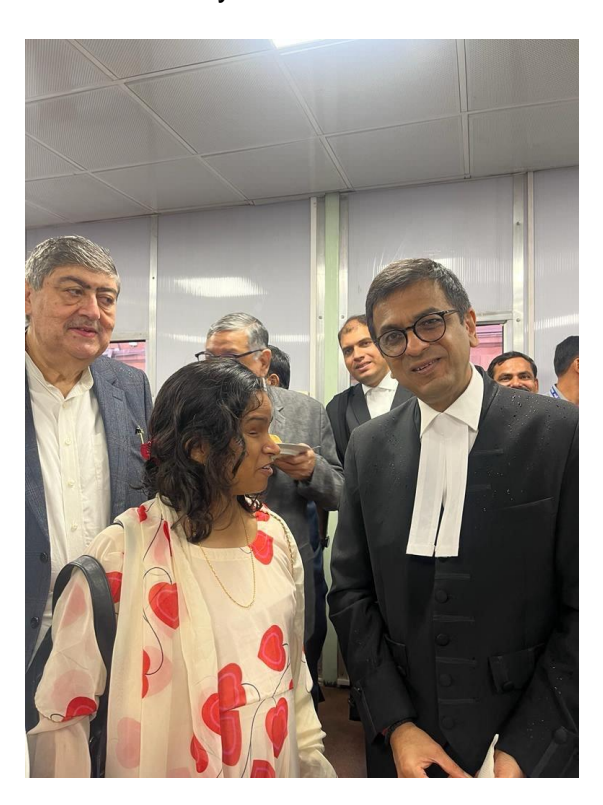
2024: Received an award by PhD Commerce Chamber on February 9, 2023 for my work in Accessibility.