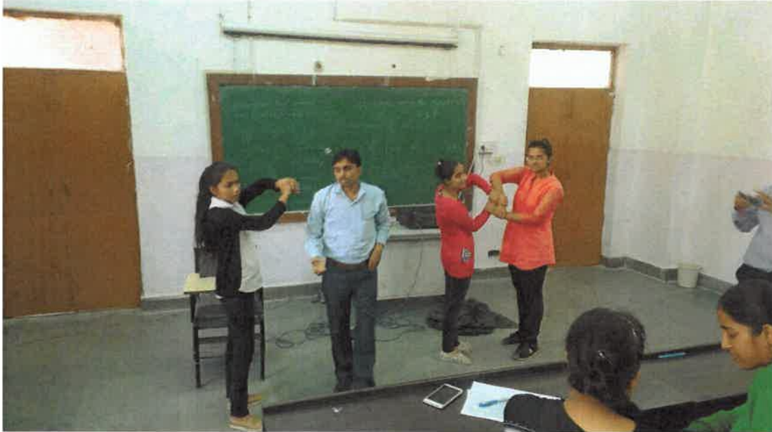
They demonstrated how to form a stretcher using a strong heavy cloth (blanket) to carry an unconscious person.