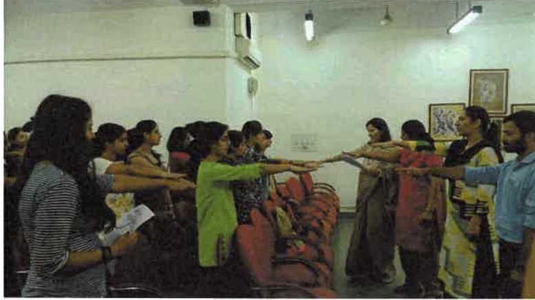
Pledge on Rashtriya Ekta