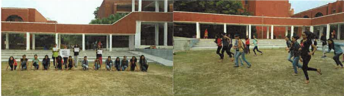
Unity Run by NSS Volunteers