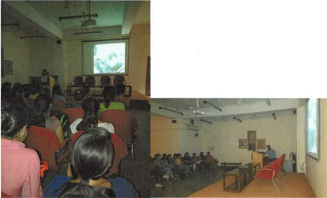
Screening of Documentary film on the theme “Unity”