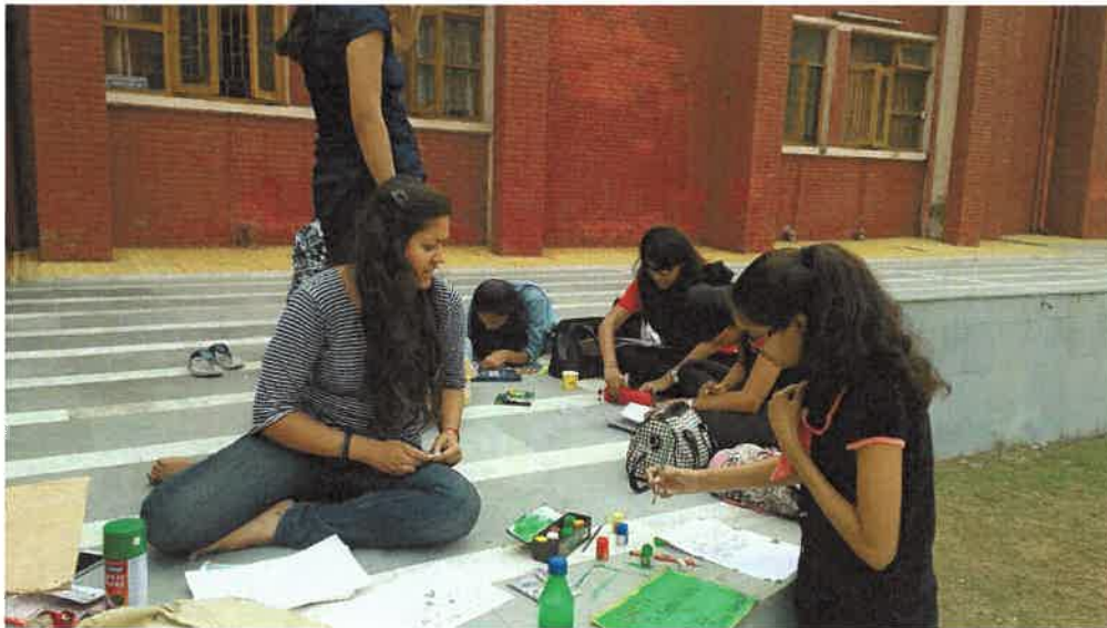
Most creative Slogan contest on the Unity Theme