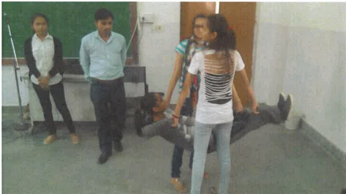
They told how to cover face by cloth for helping a person with acid attack so that there are no chances of infection while one takes him to a doctor.