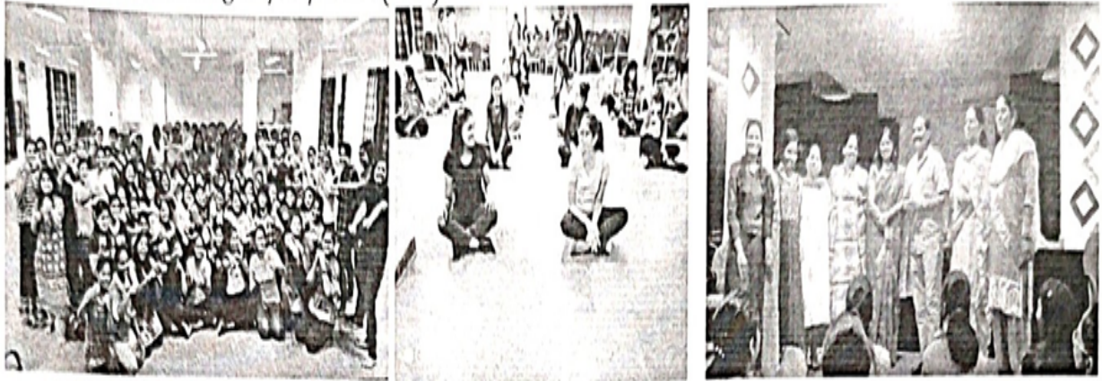
Self Defense Training 24/10/2018 (100)