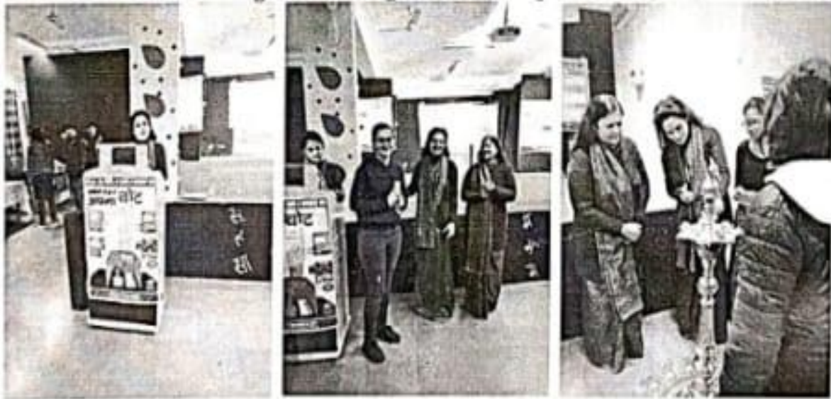
Electoral Awareness Program 16 th August to 22 nd August, 2018 (100)