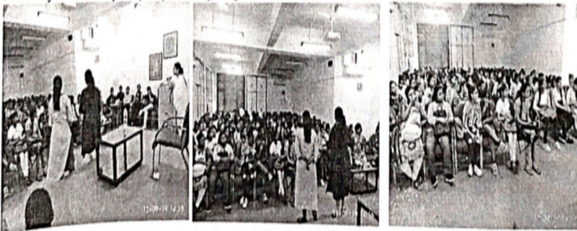
NSS Day workshop 12/09/2018 (100)

NSS day was celebrated by holding a workshop by two NGOs, Youth for Seva and Bharat Uday to sensitize students to volunteer on 12th September, 2018. Total 100 volunteers participated.