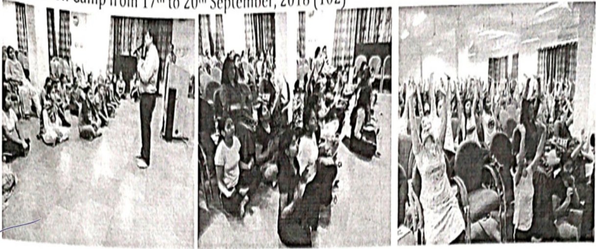
Meditation Camp from 17 th to 20 th September, 2018 (102)

NSS volunteers and other students actively participated in the 4-day meditation camp organized in collaboration with Sahjog organization on September 17 to 20, 2018 total 102 Students participated. NSS volunteers and other students actively participated in the 4-day meditation camp organized in collaboration with Sahjog organization.