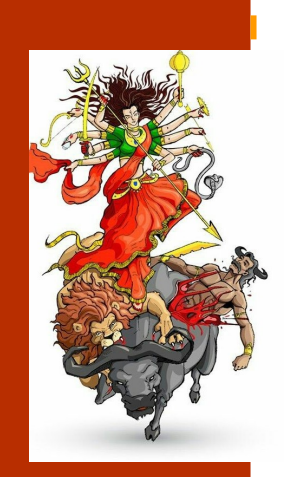
It was not a religious war,