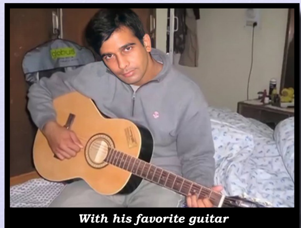
With his favorite guitar

In academy, he was not only known for his humorous, fun-loving, caring attitude, but also for the officer-like qualities he possessed that were enough to prove his ability and capability to put his country and his fellow soldiers before himself always. An upright, dedicated and an honest officer par excellence. During his NDA tenure, where he was a member of the India Squadron (Injuns) and he came out as one of the best cadets. He was amongst the best players of