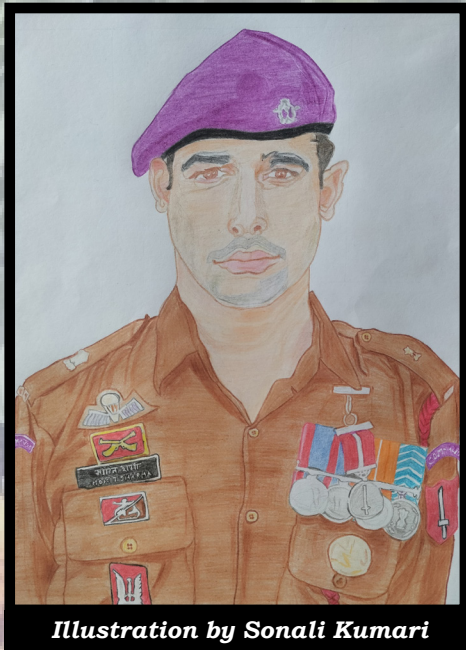
Illustration by Sonali Kumari