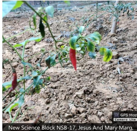
New Science Block NSB-17, Jesus And Mary Marg, Bapu dham, Chanakyapuri, New Delhi, Delhi 110021, India Latitude 28.59277047° Longitude 77.17671724° Local 10:57:20 AM Altitude 236 meters GMT 05:27:20 AM Thursday, 14.12.2023