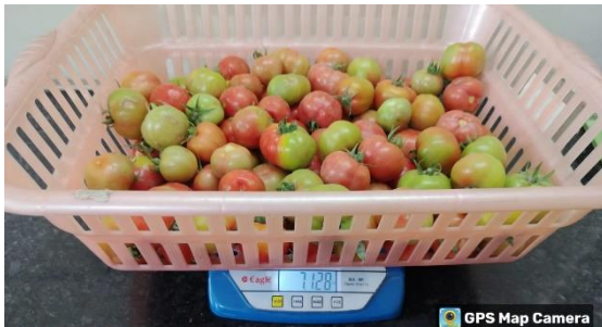
New Delhi, Delhi, India New, SCIENCE BLOCK, NSB-17, Jesus And Mary Marg, Bapu dham, Chanakyapuri, New Delhi, Delhi 110021, India Lat 28.592552° Long 77.176854° 13/03/24 11:07 AM GMT +05:30

Latitude 28.59282092191279° Longitude 77.17677821405232° Local 10:37:30 AM Altitude 236 meters GMT 05:07:30 AM Tuesday, 05.03.2024