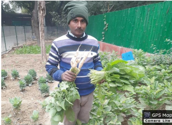
3rd Floor, Maitreyi College New Science Block, Chanakyapuri, New Delhi, Delhi 110021, India

Latitude 28.592821885831654° Longitude 77.17683671973646° Local 01:06:08 PM Altitude 236 meters GMT 07:36:08 AM Monday, 08.01.2024