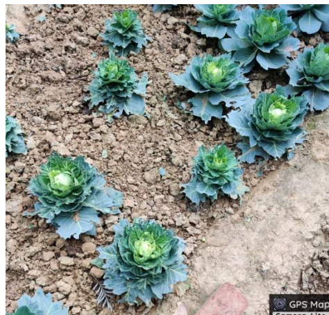
3rd Floor, Maitreyi College New Science Block, Chanakyapuri, New Delhi, Delhi 110021, India Latitude 28.5928169° Longitude 77.17676327° Local 10:54:52 AM Altitude 236 meters GMT 05:24:52 AM Thursday, 14.12.2023