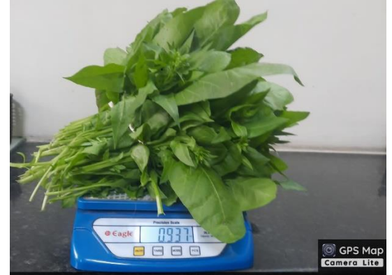
ARTS BLOCK, MAITREYI COLLEGE UNIVERSITY OF DELHI, Chanakyapuri, New Delhi, Delhi 110021, India

Latitude 28.5925845° Longitude 77.1769572° Local 10:24:18 AM Altitude 240 meters GMT 04:54:18 AM Monday, 01.04.2024