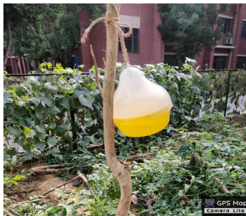
3rd Floor, Maitreyi College New Science Block, Chanakyapuri, New Delhi, Delhi 110021, India Latitude 28.59292° Longitude 77.17678329° Local 12:46:36 PM Altitude 236 meters GMT 07:16:36 AM Thursday, 14.12.2023