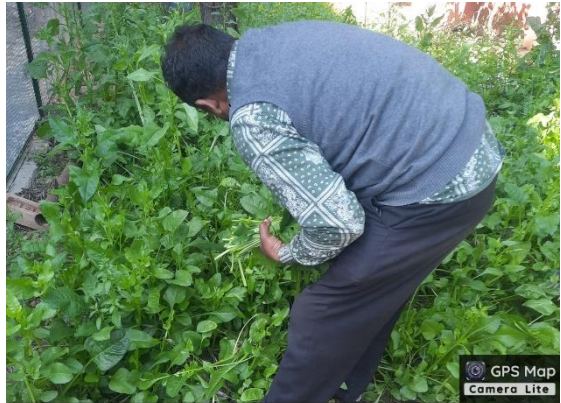
3rd Floor, Maitreyi College New Science Block, Chanakyapuri, New Delhi, Delhi 110021, India

Latitude 28.592821885831654° Longitude 77.17683671973646° Local 01:06:08 PM Altitude 236 meters GMT 07:36:08 AM Monday, 08.01.2024