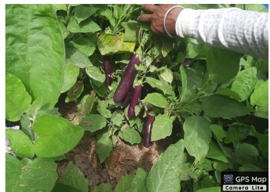
H5RG+VQ7, Jesus And Mary Marg, Bapu dham, Chanakyapuri, New Delhi, Delhi 110021, India

Latitude 28.5925845° Longitude 77.1769572° Local 10:24:18 AM Altitude 240 meters GMT 04:54:18 AM Monday, 01.04.2024