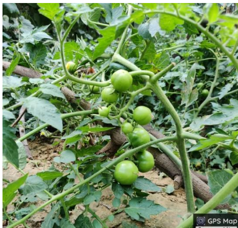
H5VG+2QP, Jesus And Mary Marg, Bapu dham, Chanakyapuri, New Delhi, Delhi 110021, India Latitude 28.59288267° Longitude 77.1768328° Local 10:50:12 AM Altitude 236 meters GMT 05:20:12 AM Thursday, 14.12.2023