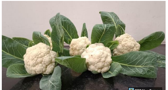
New Delhi, Delhi, India New Science Block NSB-17, Jesus And Mary Marg, Chanakyapuri, New Delhi, Delhi 110021, India Lat 28.592543° Long 77.176833° 02/02/24 11:12 AM GMT +05:30