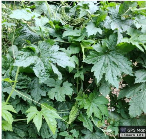
3rd Floor, Maitreyi College New Science Block, Chanakyapuri, New Delhi, Delhi 110021, India Latitude 28.5928494° Longitude 77.1774533° Local 10:42:29 AM Altitude 236 meters GMT 05:12:29 AM Thursday, 14.12.2023